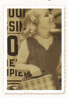
In Junior High