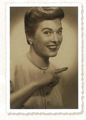
Thank you! Support for The Computer Bowl benefits the educational programs of The Computer Museum.