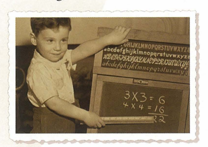
At age four and a half