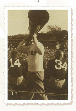
we'll give them a chance