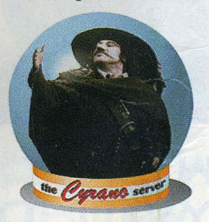
Say it with e-mail

F THE BEST YOU CAN do on Valentine's Day is copy Boyz II Men lyrics into a Hallmark card, then The Cyrano Server (http://www.