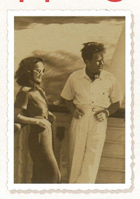
he designed the first