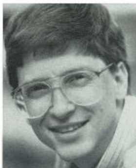
William H. Gates, III

William H. Gates, III, Chairman and Co-founder of Microsoft Corporation, has spurred development of the Museum's next major exhibition with a $250,000 grant. The 3,600 sq. ft., $1 million exhibition will show the remarkable capacity of the personal computer. Originally known as the Computer